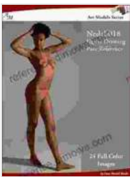
Figure drawing is an essential foundation for any aspiring artist, enabling you to capture the beauty and complexity of the human form. However, mastering the intricate details of anatomy, proportion, and movement can be a daunting task. That's where our revolutionary book, Pose Reference Art Models Poses, comes into play.