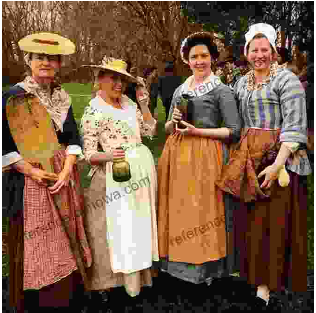
When Freedom Comes: Hope's Revolutionary War Diary #3 (Hope's Revolutionary War Diaries)